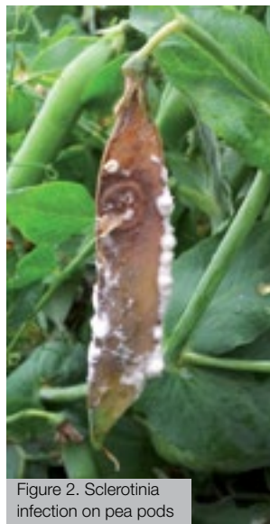
Figure 2. Sclerotinia infection on pea pods