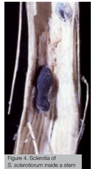
Figure 4. Sclerotia of S. sclerotiorum inside a stem