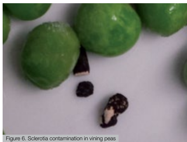
Figure 6. Sclerotia contamination in vining peas