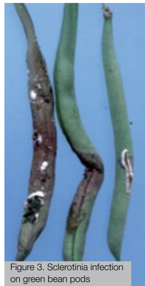
Figure 3. Sclerotinia infection on green bean pods