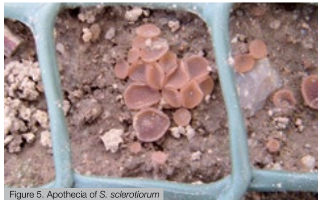
Figure 5. Apothecia of S. sclerotiorum

As the disease develops, the hyphae of the pathogen form small clumps of mycelium (Figures 2 and 3) which mature into the hardened black sclerotia. These may be found on the outer surface of the diseased tissue, or inside pods and stems (Figure 4). Plants may die due to infection and produce may be contaminated with sclerotia (Figure 6).