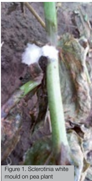
Figure 1. Sclerotinia white mould on pea plant

The broad range of crops that are susceptible to S. sclerotiorum lead to a build-up of the pathogen within the rotation and losses generally relate to the extent of infection. However, in green beans and vining peas there is zero tolerance for infection as the entire crop may be rejected if contamination with sclerotia is found.