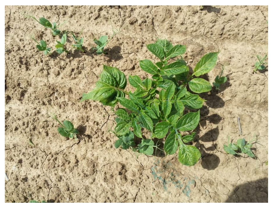
Fig 2. Dye both on the ground and on the potato.

During application of the dye it was noticed that on occasion a proportion of the dye would be deposited both on the target and on the ground adjacent. Fig 2.