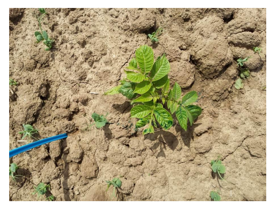
Fig 1. Early potato emergence means good size difference for effective targeting.

The 12.5 cm row width for the 2014 commercial crop was narrower than the previous row widths tested (2013) and consequently more challenging for the vision guided equipment.