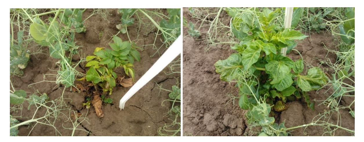
Fig 3. Glyphosate treated potato 27<sup>th</sup> June Fig 4. Reaction to sub lethal dose of 2014. glyphosate.

The results show a clear increase of spray interception by the volunteer potatoes using wider widths of 20 and 25cm as were used in 2013 compared to the 12.5cm row widths used in 2014. The wider rows allowing a greater inter row 'free' space within which potatoes could be targeted in isolation.